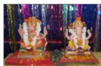
Head Office Ganapati Utsav