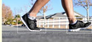
Position your feet as shown in this picture while jogging.

If you're walking outside in daylight, you'll be boosting your body's stores of vitamin D – a nutrient that's hard to get from food, but that we can synthesise from exposure to sunlight. Many people in the UK are deficient in vitamin D and it's a nutrient that plays a big role in everything from bone health to immunity. While sun safety is still important. Experts agree that exposing as much