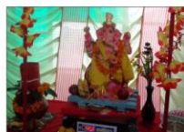
Parwanoo Ganesh Festival