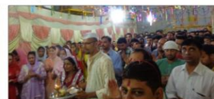
Parwanoo Ganapati Celebrations