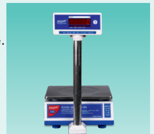
Rod type display