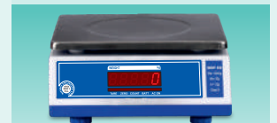
Rear side on Machine Display