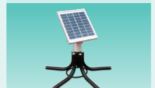
Solar Panel with Stand