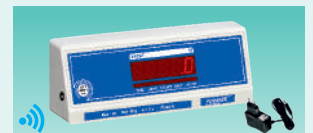
Wireless RF display